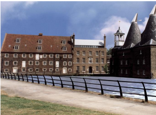
The House Mill and Miller's House at Three Mills