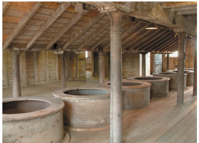
first floor of the House Mill