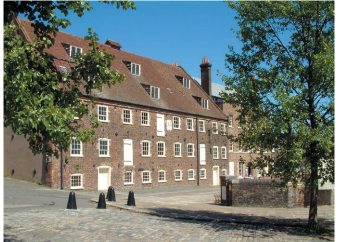
The House Mill