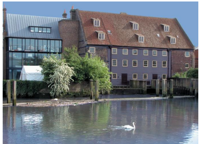
The House Mill and Miller's House, viewed from the north